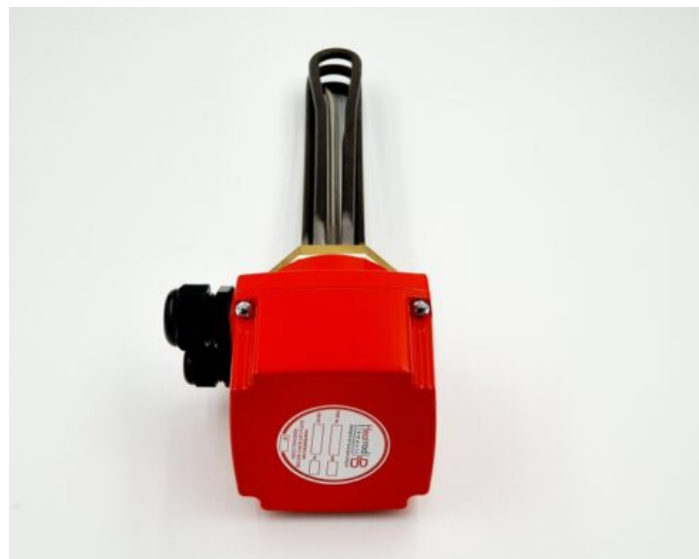
HRZi Heavy Duty Industrial Titanium Immersion Heater